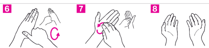
Frote rotacionalmente el pulgar izquierdo con palma derecha y viceversa Frote rotacionalmente, hacia adelante y hacia atrás los dedos de mano izquierda en palma derecha y viceversa Una vez secas, tus manos están seguras